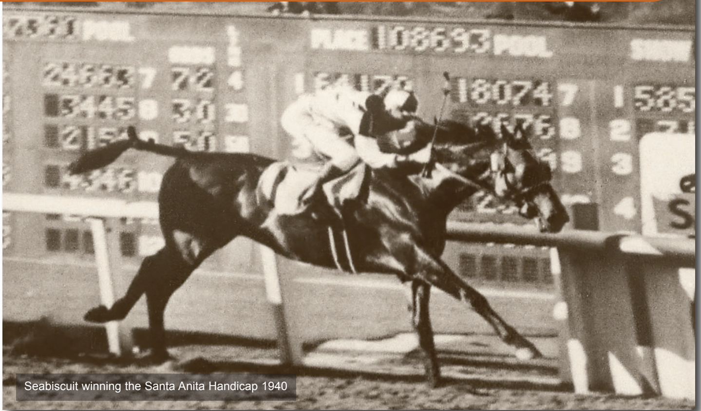
Seabiscuit winning the Santa Anita Handicap 1940