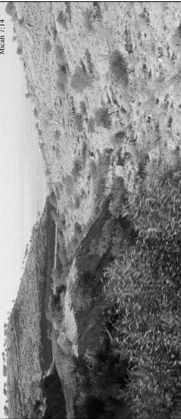
Region of Gilead