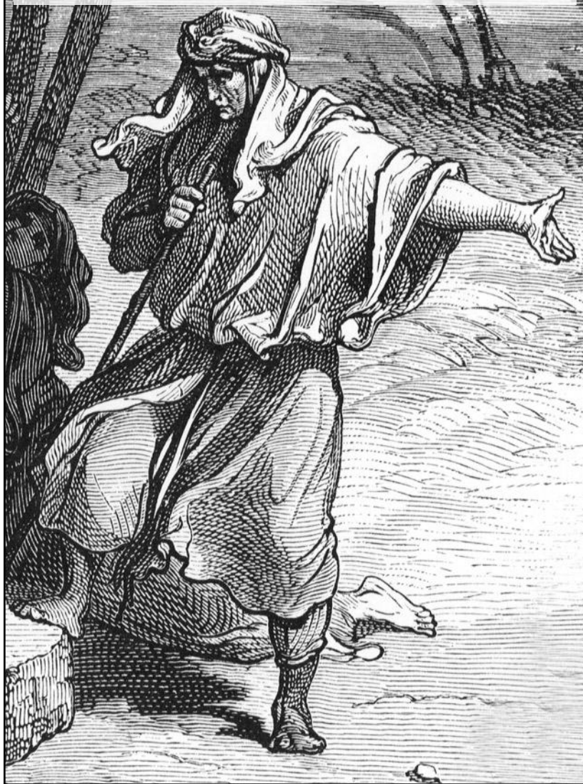
Artwork by Gustave Doré