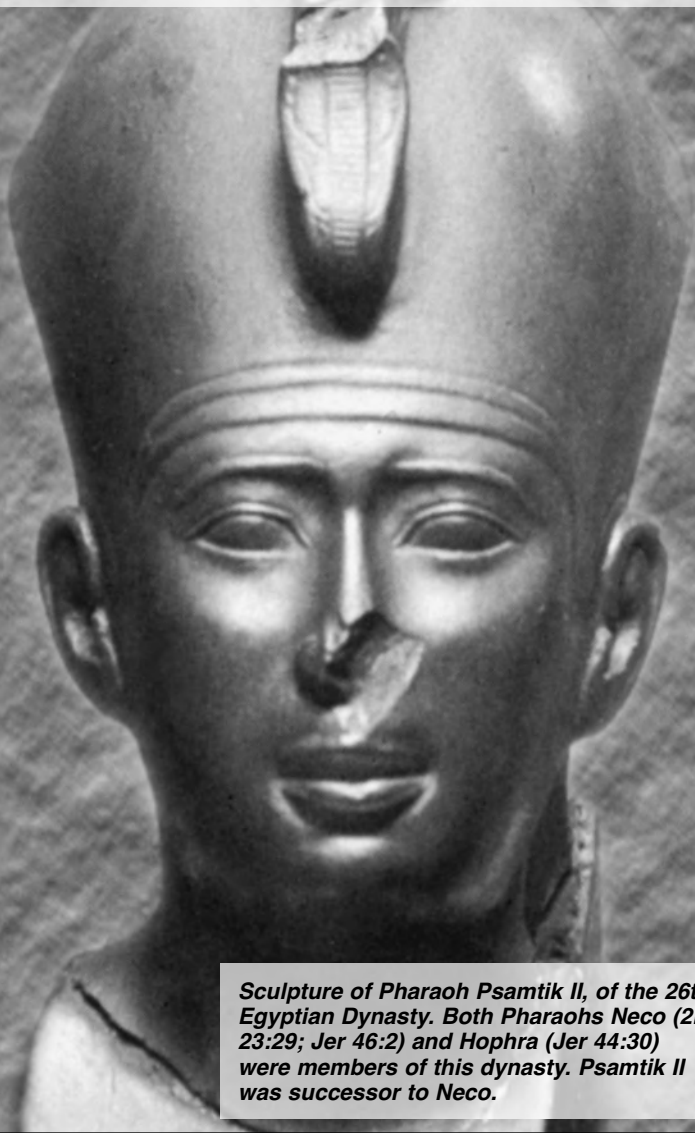
Sculpture of Pharaoh Psamtik II, of the 26th Egyptian Dynasty. Both Pharaohs Neco (2Ki 23:29; Jer 46:2) and Hophra (Jer 44:30) were members of this dynasty. Psamtik II was successor to Neco.