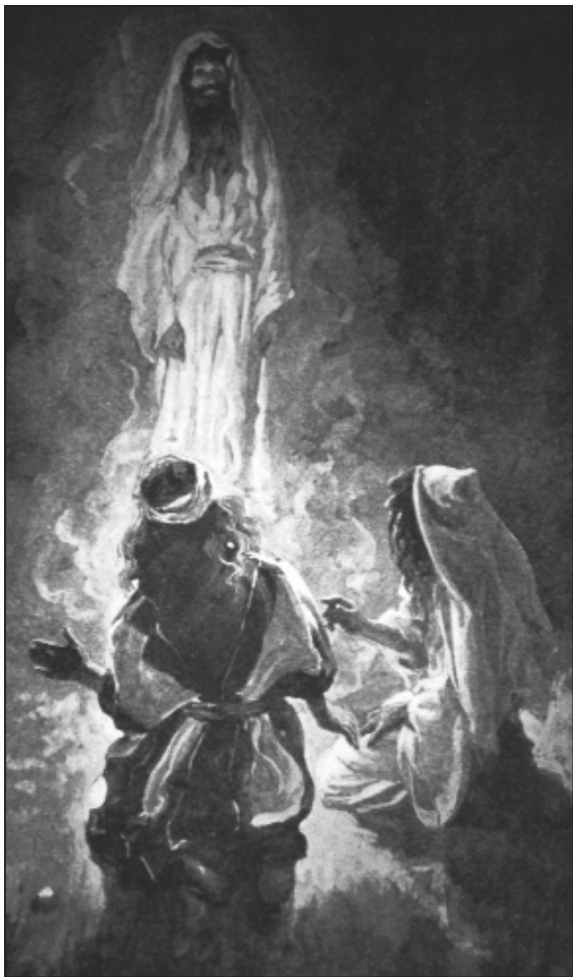
Artwork by James Tissot